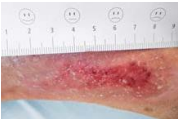
3. 26.11.2013 The aim of the therapy was achieved after changing dressing seven times.