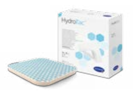
HydroTac® closes the wound.