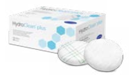
HydroClean® plus cleans the wound.